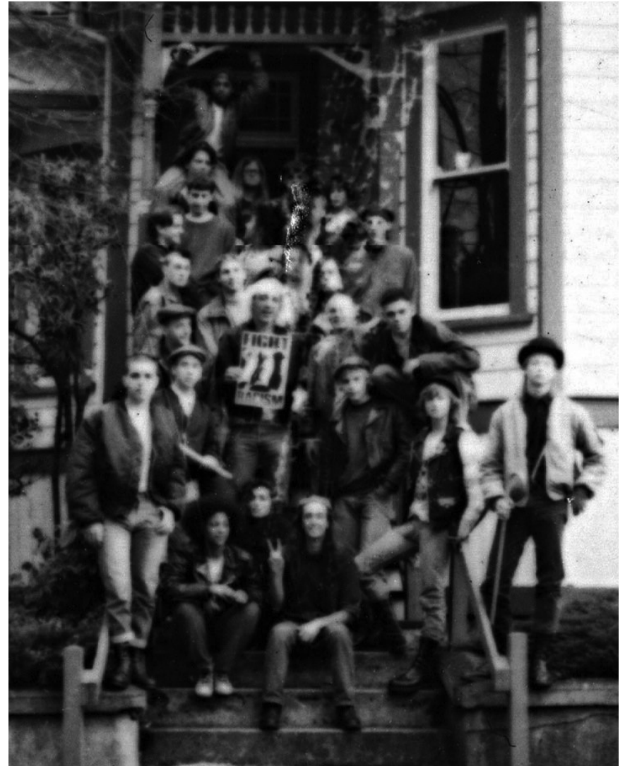
First Anti-Racist Action conference, held at a house in Portland, OR